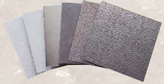
Six high-grade finishes available