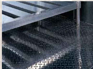
Diamond tread plate floor