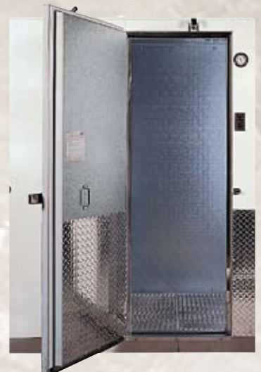
Optional heavy-duty kick plate