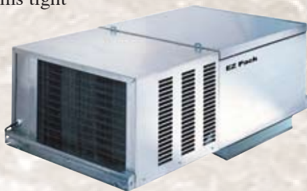
Top-mounted refrigeration unit (side and remote units also available)